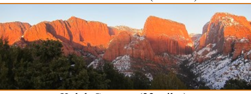
Kolob Canyons (22 miles)