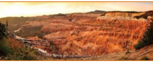
Cedar Breaks National Monument (32 miles)