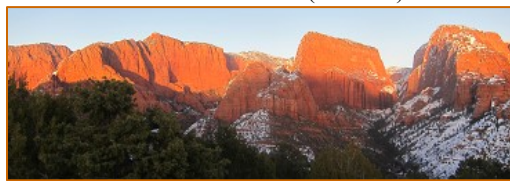
Kolob Canyons (22 miles)