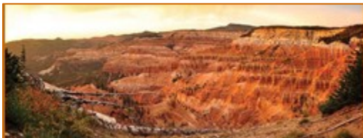
Cedar Breaks National Monument (32 miles)